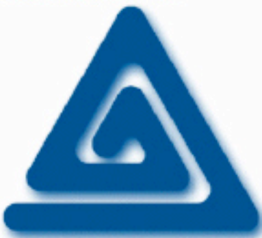
(U) BLogo aka "Boy Lover"