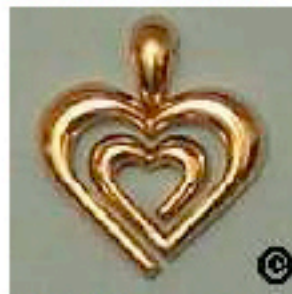
(U) GLogo Pendant

(U) The ChildLover logo (CLogo), as shown below, resembles a butterfly and represents non-preferential gender child abusers. The Childlove Online Media Activism Logo (CLOMAL), also represented below, is a general purpose logo used by individuals who use online media such as blogs and webcasts. 4