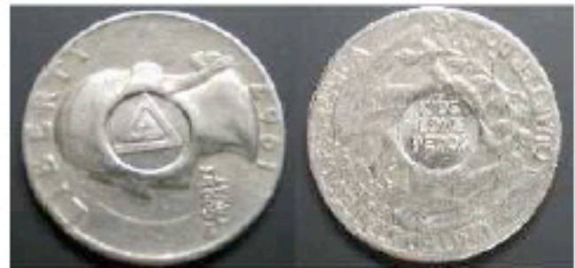
(U) BLogo imprinted on coins