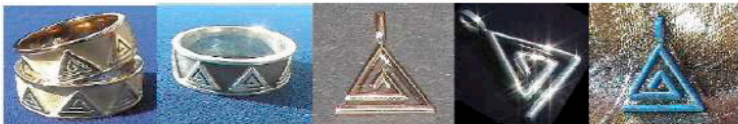
(U) BLogo jewelry