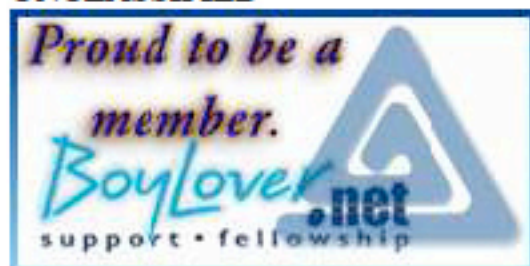
(U) Boylover.net banner