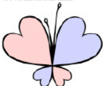
(U) CLogo a.k.a. "Child Lover"