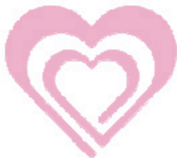
(U) GLogo a.k.a. "Girl Lover," Childlove